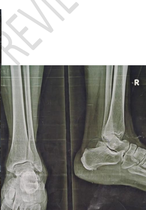
Pre operative xray- right anke joint