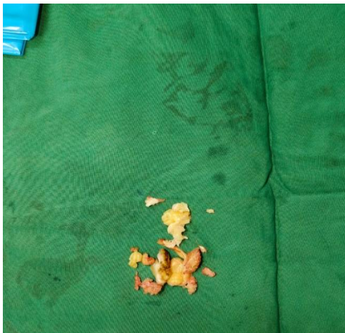
53 Post operative image showing removed 54 osteophytes

51 Based on the radiological findings and long standing systems , surgical management for all 52 patients was planned , which consisted of ankle joint debridement and osteophytes excision.